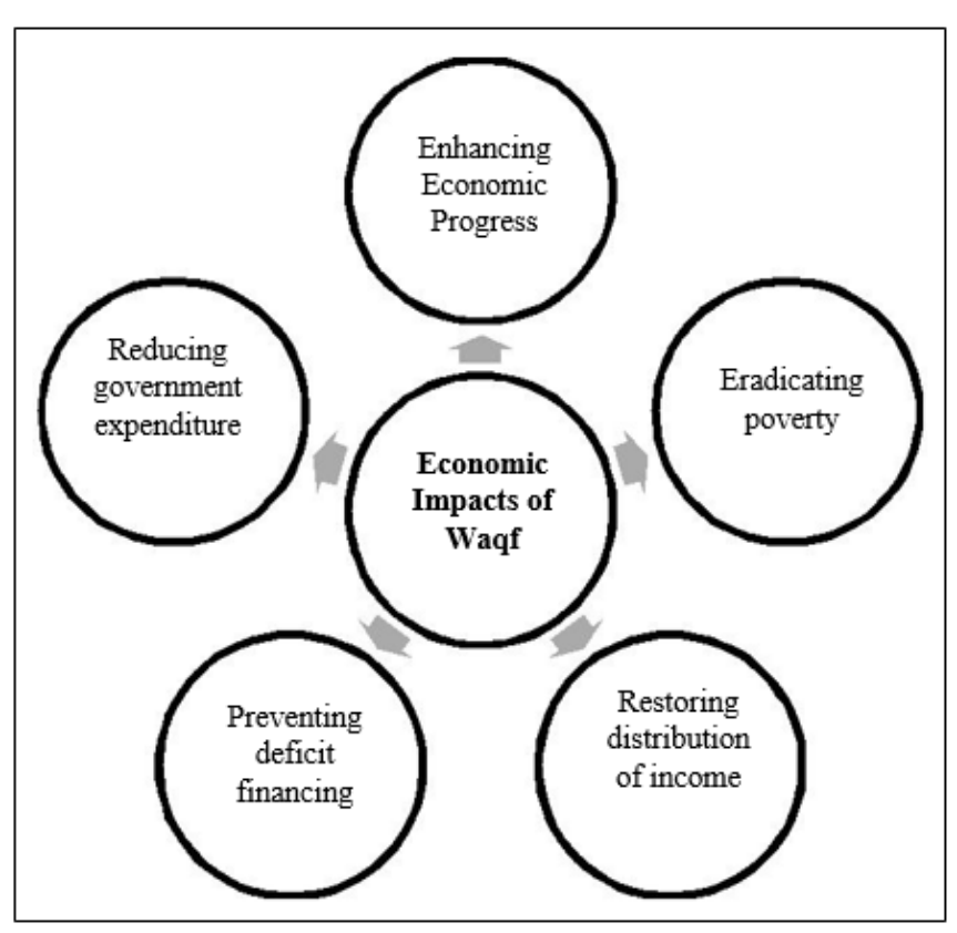
Figure 2: The Role of Waqf in Economic Development

The current alarming economic scenario can be radically changed and developed through the formation of waqf and its proper management. How waqf can contribute to economic development is shown in the following figure (Figure 2).